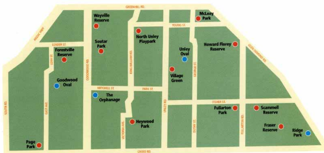
Figure 2: Unley Dog Exercise Areas

The areas declared are set out below. The Dog Exercise Areas are illustrated in Figure 2.